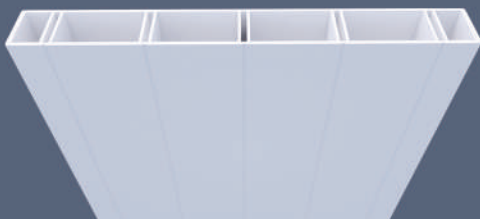
DelPro Xtend 6" Window Jamb Extension [customizable to various widths]