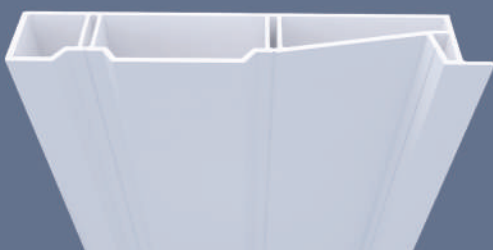
DelPro Xtend 4 3/8" Window Jamb Extension